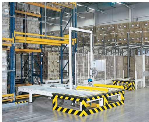
The conveyor which is used for relocating pallets from finished goods storage to the truck or railway loading area.