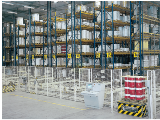
Acceptable pallets are transported to the I-Point via a chain conveyor.