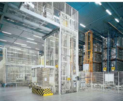
Production goods at a height of app. 6000mm are moved to an elevator. The elevator lowers the pallet app. 5500mm and hands it over to a chain-conveyor.