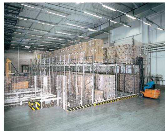
The flow storage system is a two storey construction consisting of 12 lanes. In each of these lanes, 18 pallets are prepared for truck loading.