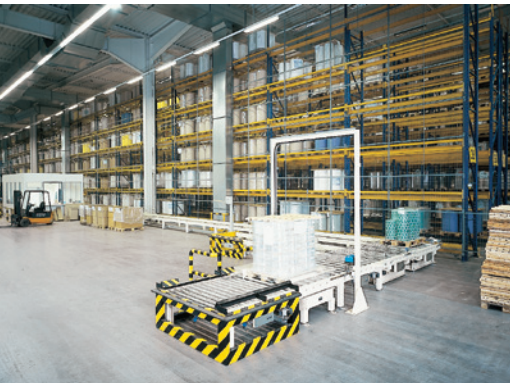
Stock reception point (I-Point) and Contour-check