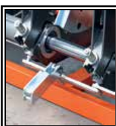
Detach device for heater