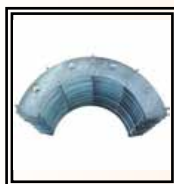
Inserts Ø 280 ÷ 560 mm