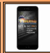
App "Set & Go Pro"