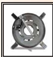
Tool for flange necks