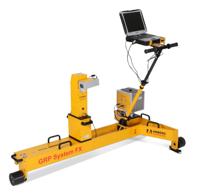
Fig 2: Amberg system GRP 3000