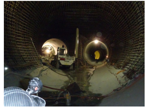
Fig 2: Pressure runnel under construction