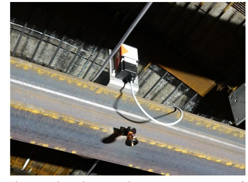
Fig 2: Dimetix D-Series Sensor mounted on crossbar