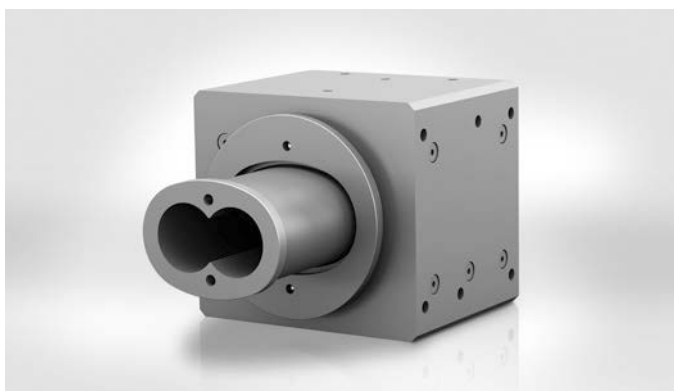
Newly developed elliptical shoulder liners provide optimum wear protection

The geometrical dimension of screw shaft and screw elements, the screw preloading system and the geometry of the connecting sleeves have been optimized in order to safely transmit and fully exploit the high torque of up to 16 Nm/cm 3 . Innovative screw concepts with an increased OD/ID diameter ratio of 1.65 give substantially higher output rates at considerably lower energy consumption.