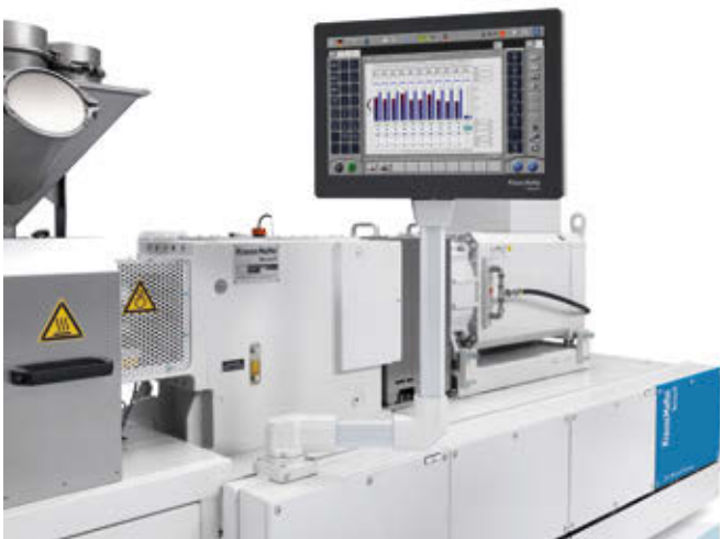
Central operator panel for maximum ease of operation

The tried and tested Process control - Berstorff Process Control (BPC-Touch) is clearly structured and self-explanatory. All components – from the metering system to the pelletizer – can be directly controlled from the central operator panel.