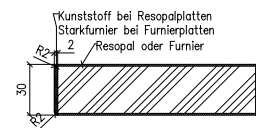
Plate C: 30 mm thick, high-quality multi-layer plywood plate E1, top surface optionally covered with HPL plastic or wood veneer according to the BRUNE® collection. Lower surface white HPL or beech veneer. Straight edge, 2 mm thick, in material to match table top (plastic for plastic, veneer for veneer).

Platte R: 30 mm thick, MDF, surface coated in high-pressure laminate (HPL) or veneer according to BRUNE® collection. Underside: HPL white or beech veneer. Edges MDF, straight edges, 10 mm thick, beveled over 45 mm..