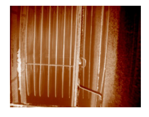
Superheat pendants in 700MW power boiler burning PRB coal

BoilerSpection MB is a completely digital and IP addressable camera system that utilizes standard connections for viewing and recording real-time images. It also includes a standard video (BNC) output for use with legacy video equipment.