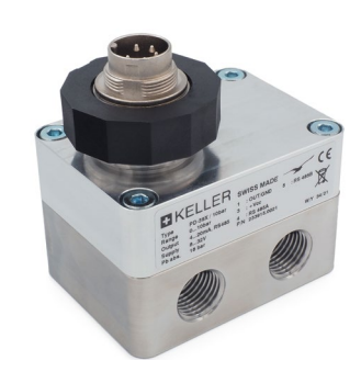
Low Pressure Version