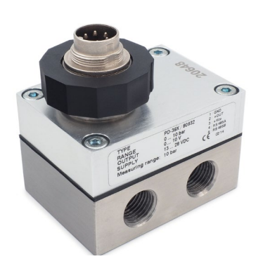
Medium Pressure Version