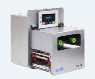
Print modules PX Q