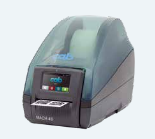
Label printers MACH 4S