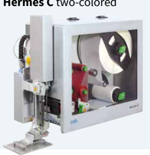
Print and apply systems Hermes C two-colored