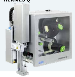
Print and apply systems HERMES Q