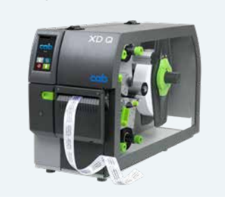
Label printers XD Q double-sided