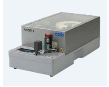
Tube labeling systems AXON 1