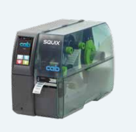
Label printers SQUIX 2