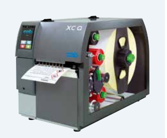
Label printers XC Q two-colored