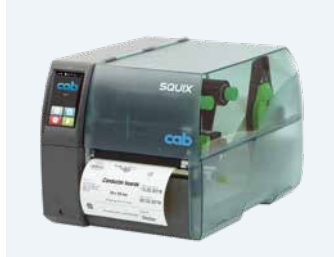
Label printers SQUIX 6.3