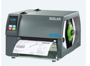
Label printers SQUIX 8.3