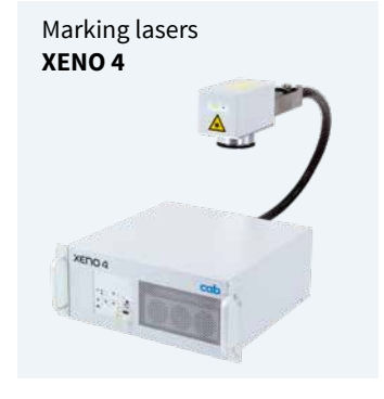
Laser marking systems