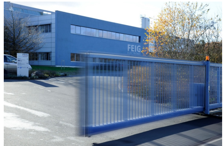
Perimeter Protection: Fast and safe access to industrial plants etc.

Suitable loop detectors and motion detectors are available from FEIG ELECTRONIC.