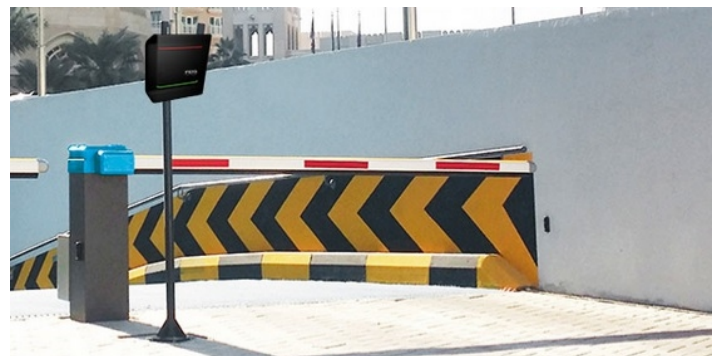
Parking Management: Comfortable access without waiting

The "Teach-In Mode" is used to teach the transponders to be accessed without the use of the software. If the reader is in this mode, all read transponders are automatically transferred to the access database.