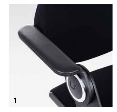
1 | ARMREST VARIANTS

Choose between a leather upholstered armrest wrap (with the aluminium seat shell) or completely leather covered.