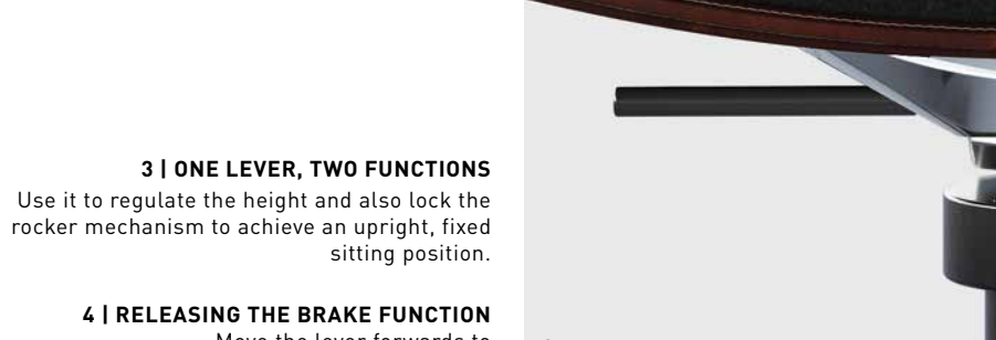
4 | RELEASING THE BRAKE FUNCTION Move the lever forwards to deactivate the brake function.

From the stand position, press the button to release the backrest. Flip it over so that it becomes the backrest for the chair again.