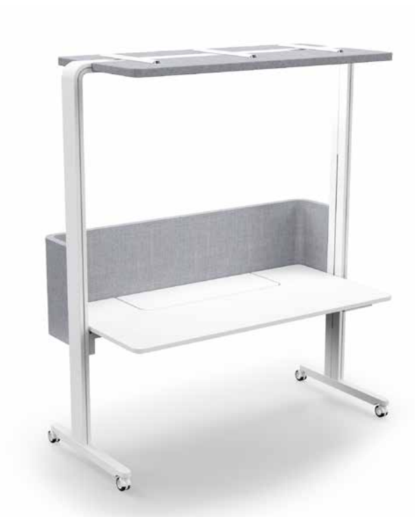
K+N STANDBY.OFFICE 2.0 Flexible, space-saving all-in-one solution for agile working methods.