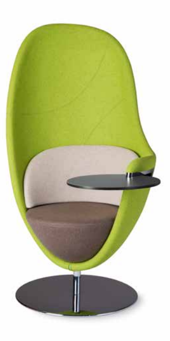
NET.WORK.PLACE Lounge Chair Personal haven for distraction-free communication