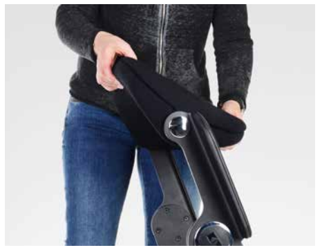
Fold up armrests/backrest.