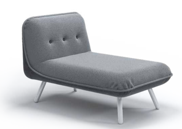
NET.WORK.PLACE Organic For creating communication areas