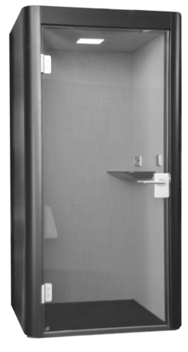
QUIET.BOX Organic Stand-alone furniture unit for more privacy in the office.