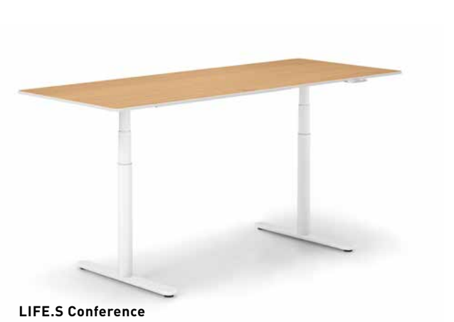
Desk system available in different variants and designs.

A harmonious working environment for your needs: on your own or as a team, for focused or communicative work.