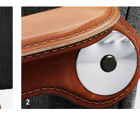
2 | SIMPLE TO CHANGE POSITION

Choose between a leather upholstered armrest wrap (with the aluminium seat shell) or completely leather covered.