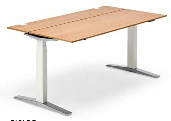
TABLE.T Sit/stand desk for a dynamic working position.