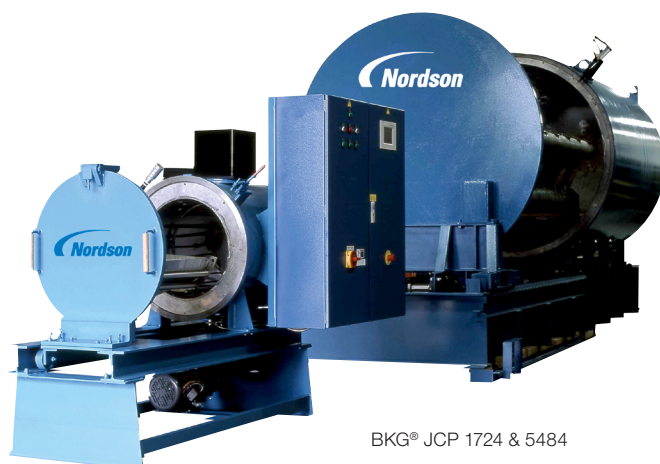
BKG® JCP 1724 & 5484