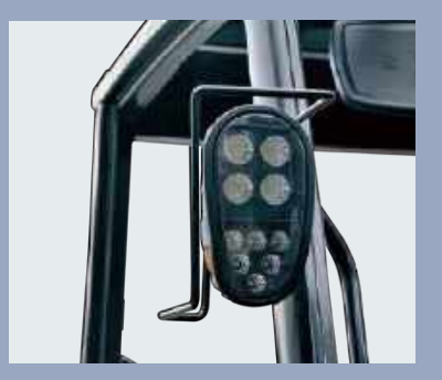
The new efficiency lighting system employs LED illuminant and new type reflector to reduce energy consumption, improve significantly illumination.