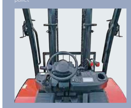
The new designed steering wheel\ new brake system and the easy-to-operate levers provide total bandling operation