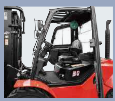
The large, spacious cab of our new boast: left and right grab handles with wide-opening doors for easy access