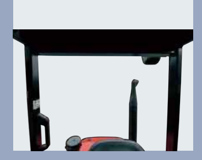
Optimized designing structure to offer a good visibility and easy entrance of the