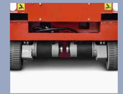
lotor and brake