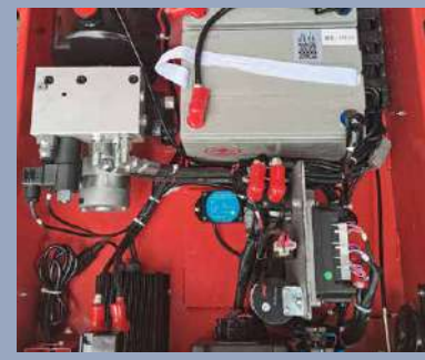
The parts are well located