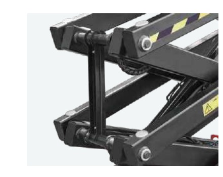
Supporting arms, To protect the operator when he is doing repair or maintenance job