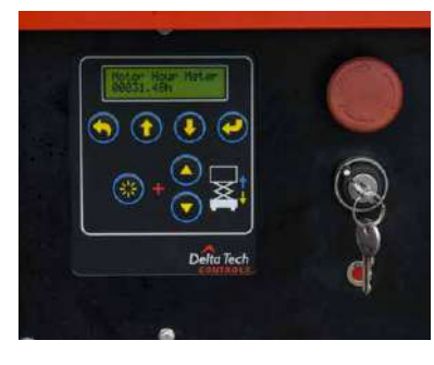
LCD screen, used to display fault code and adjust parameters