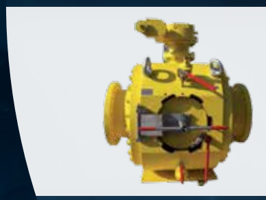
DN 500 PN 50