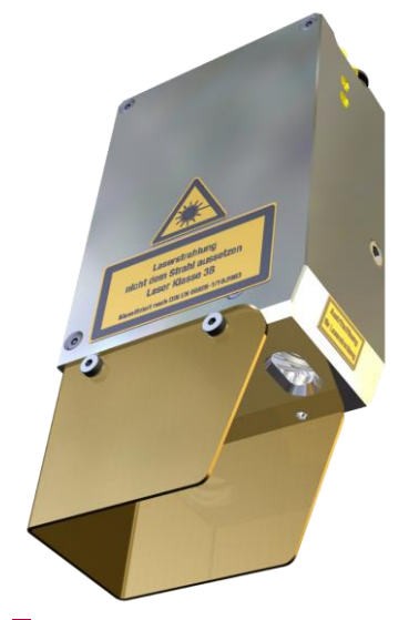
Triangulation sensor for seam tracking