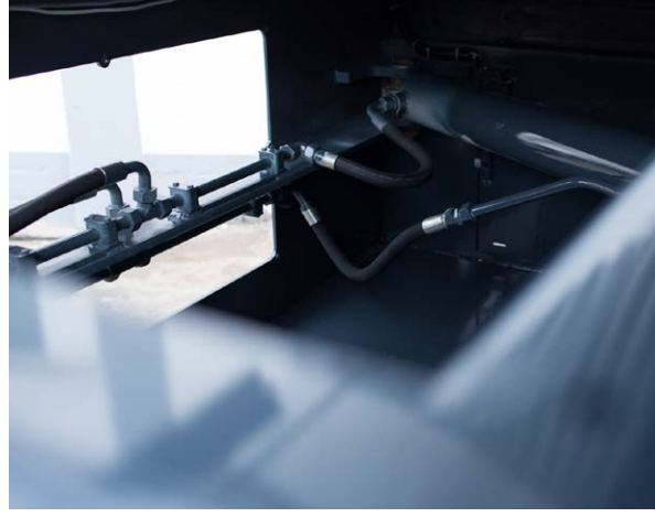
Large mainentance opening