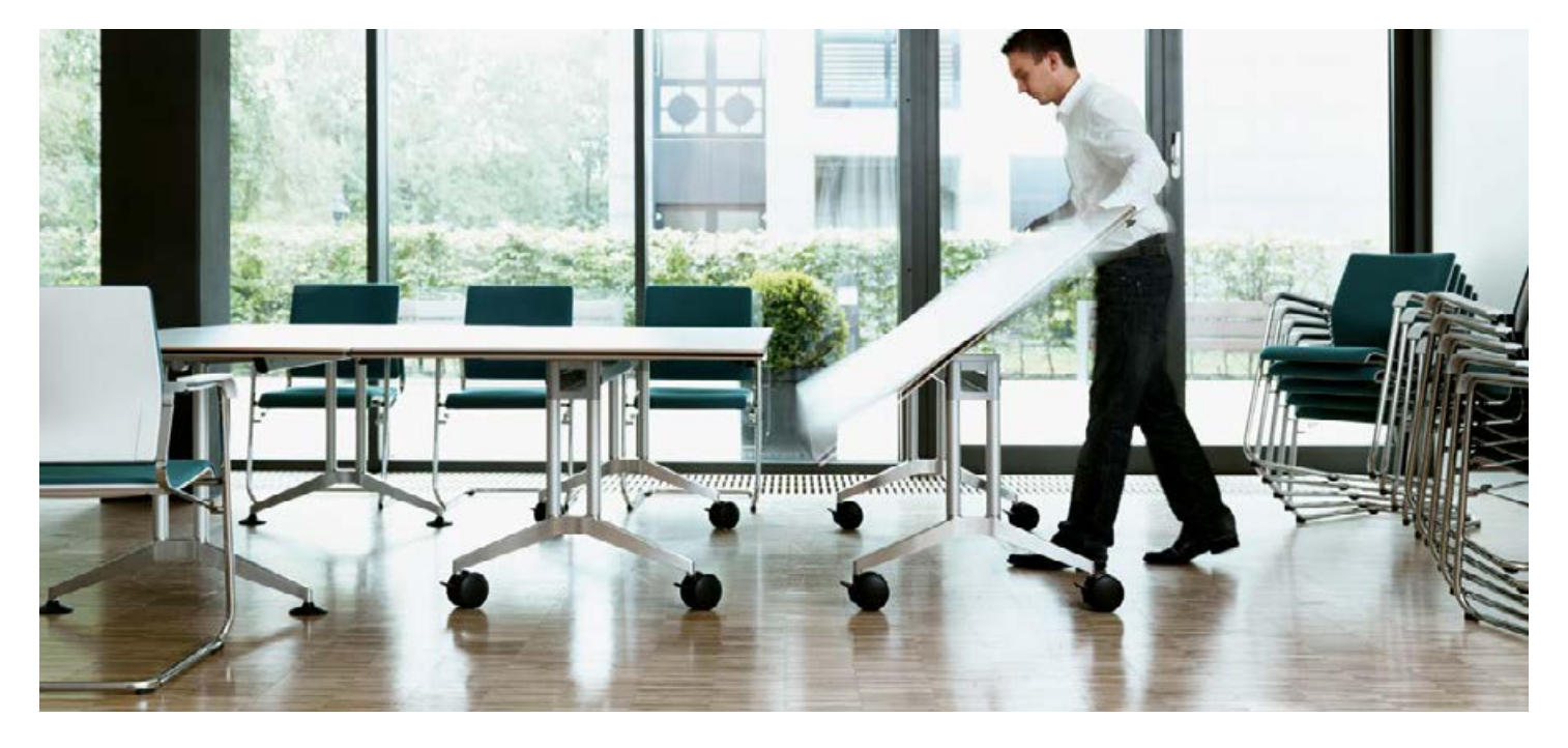
In a horizontal position, it is virtually identical to Logon. In a vertical position, the stackable Timetable Shift fully expresses its capability. The centre aluminium profile acts as an integrated cable channel that is easily accessible via a single table portal.