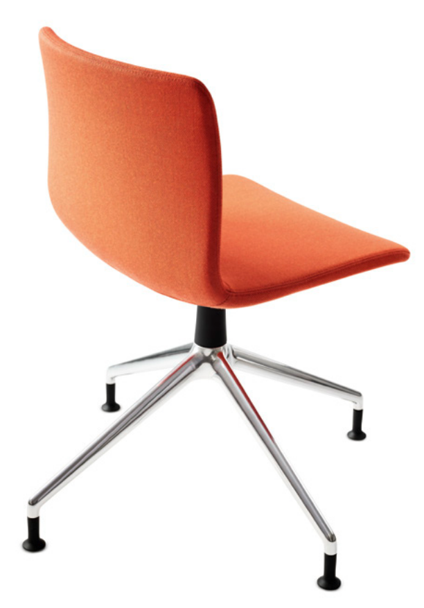
227/33 Swivel-mounted visitor chair with glides

The contours of the seat shell, armrests and base frame coordinate with each other perfectly, making the chair easy to combine with a variety of table shapes. And what's more, with high-luster-polished or black-coated frame surfaces and the wide range of upholstery materials and colors, Pep is an ideal match for a whole range of interior design concepts.