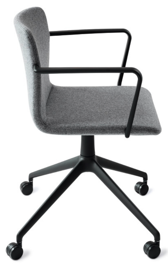
227/33 Swivel-mounted visitor chair with armrests and casters