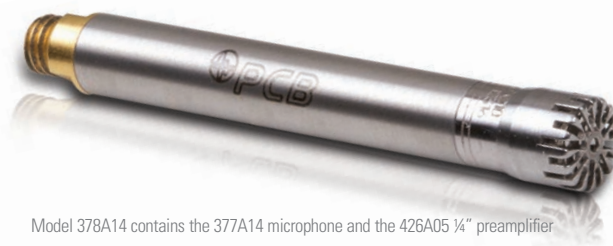
Model 378A14 contains the 377A14 microphone and the 426A05 1/4" preamplifier