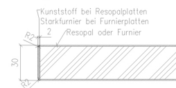
Plate D-LB: 30 mm thick, 28 mm thick (lightweight) poplar plywood board, top surface optionally covered with HPL plastic or wood veneer according to BRUNE® collection. Lower surface white HPL or beech veneer. Edge with solid beechwood edge band, smooth finish, 9 mm thick.

Plate C-LB: 30 mm thick, 28 mm thick (lightweight) poplar plywood board, top surface optionally covered with HPL plastic or wood veneer according to BRUNE® collection. Lower surface white HPL or beech veneer. Straight edge, 2 mm thick, in material to match table top (plastic for plastic, veneer for veneer).