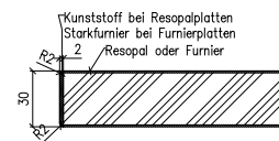
Plate C: 30 mm thick, high-quality multi-layer plywood plate E1, top surface optionally covered with HPL plastic or wood veneer according to the BRUNE® collection. Lower surface white HPL or beech veneer. Straight edge, 2 mm thick, in material to match table top (plastic for plastic, veneer for veneer).

Platte R: 30 mm thick, 28 mm strong multi-layered plywood, surface coated in highpressure laminate (HPL) or veneer according to BRUNE® collection. Lower surface: HPL white or beech veneer. Edges multi-layered plywood, straight edges, 9 mm thick, beveled over 45 mm.